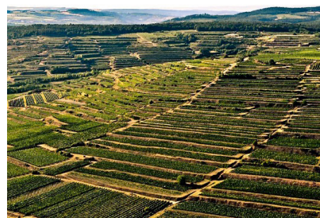
Single vineyard Gaisberg