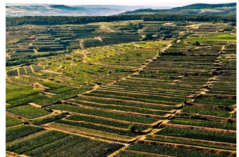
Single vineyard Gaisberg